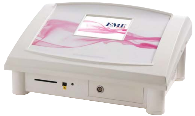
E110156 PRESSOMASS 707: Desk device for presso massage with 7 independent sectors, certified as CE aesthetic use.